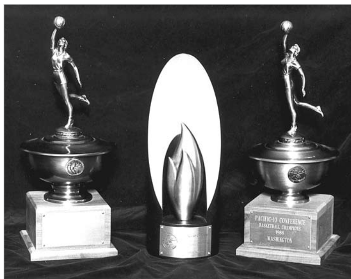
Washington has won three league championships since the Pac-10 started sponsorship of women's basketball in 1986-87. The Huskies took home the trophies for the 1987-88, 1989-90 and 2000-01 seasons.